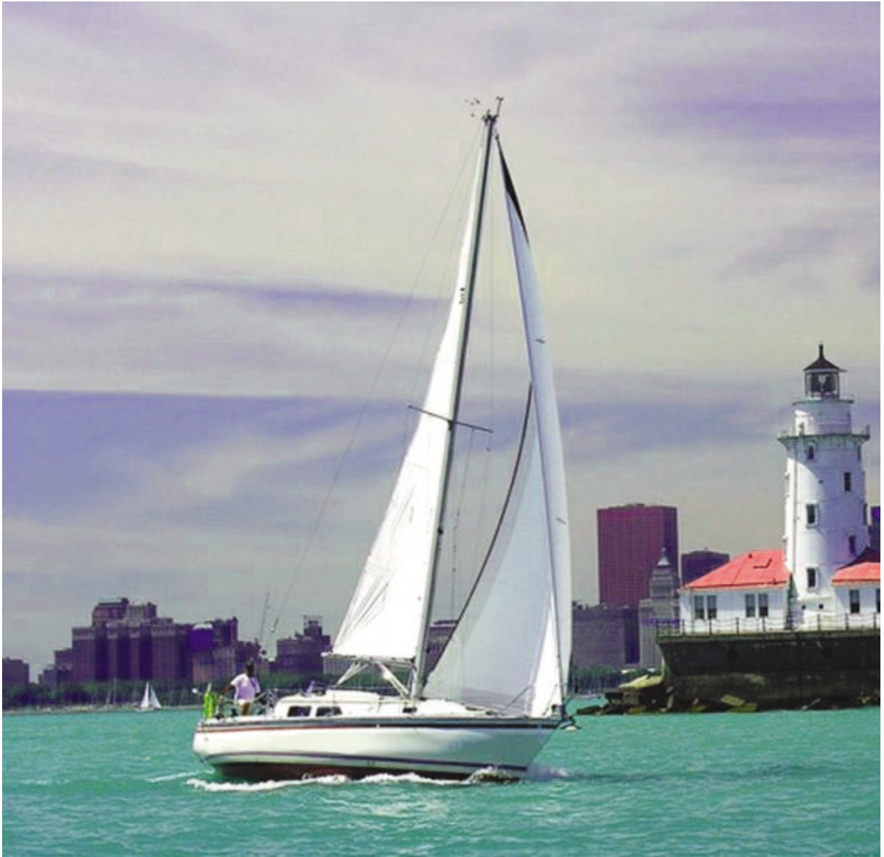
Captain Ward's Unknown Lady , a 30 foot Newport