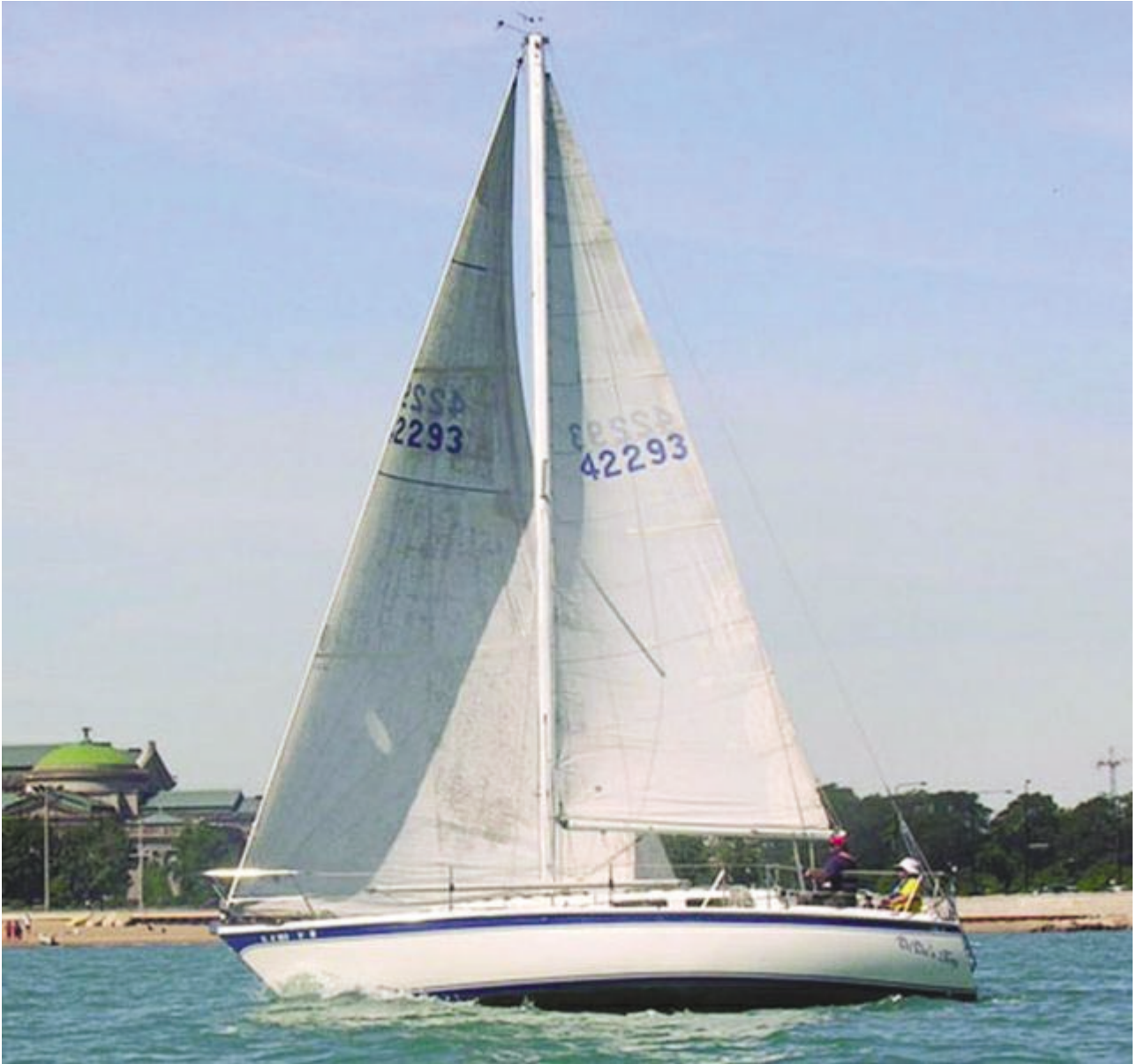
DeDa's Toy - 31 ft Cal